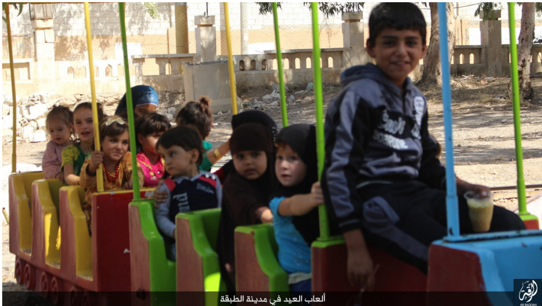
ألعاب العيد في مدينة الطبقة